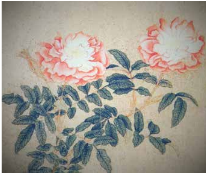
Double red-form of Rugosas painted by Qian Xuan in Yuan Dynasty, nearly 800 years ago.

Apparently, the double magenta form derived from R. rugosa first appeared at least 800 years ago, based on this very vivid and detailed painting by Qian Xuan in the Yuan Dynasty (1271-1368).