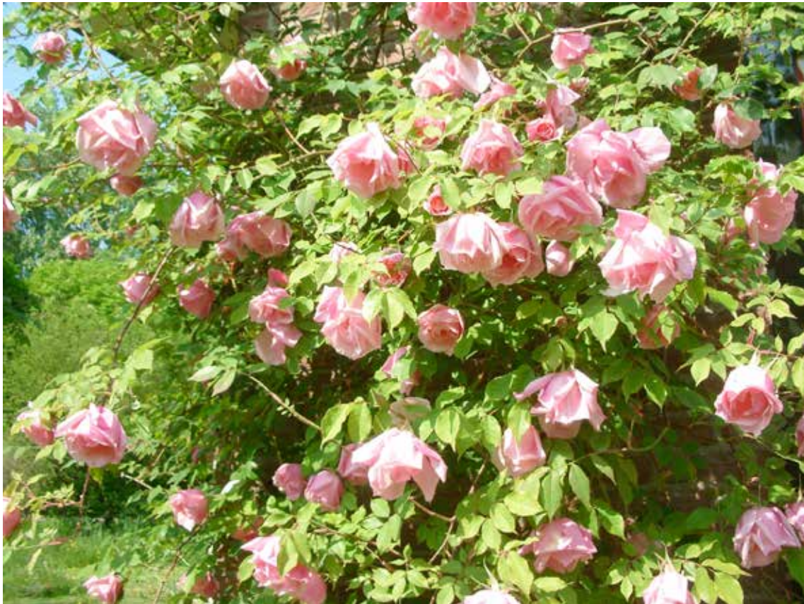
Rosa 'Lijiang Rose' ( Rosa gigantea f. erubescens ) – From N.W. China

Sometimes people are erroneously using the word 'family' instead of class or group and 'race' instead of cultivar. The family is Rosaceae (rose family) with many genera, species and cultivars. According to the Code the word 'race' is no longer allowed. The use of the term 'species roses' is botanically incorrect. Better is 'rose species'. However, the best seems to me 'wild roses'. The term 'botanical species' is also incorrect or at the least redundant, because all plants are botanical.