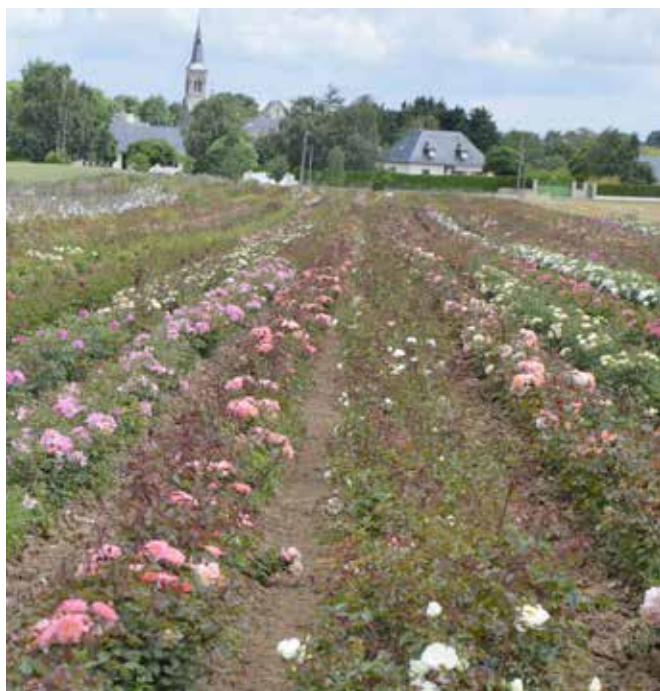
"Jardirose" one of the rose fields

My wife Isabelle and I set up "Jardirose" in 1982, at Doué la Fontaine (Maine et Loire Department), located in one of the largest rose-growing regions of France, renowned for its temperate climate (between 25 and 2 degrees celsius) with predictable rainfall. The limestone soil of our nurseries is chalky over a subsoil of tender shelly marl that permits good water reserves.