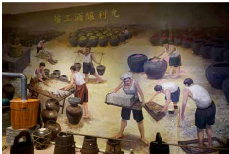
A model of the traditional process of brewing Tuwei Wine

A little later, in the start of Ming Dynasty (ca.1368), 'Tuwei' was widely planted to produce "Tuwei Wine", which retained a modest and unique Rugosa-like fragrance. Up to the present day, Tuwei Wine can be drunk as a locally-produced beverage. Of course, Tuwei Wine is not only enjoyed for itself, but also for its role in Chinese culture and folklore. However, what is incredible is Tuwei production for wine is still limited to a very small town in Guangdong Province since it seems difficult to cultivate on large scale. The plants must be grafted with a very special rootstock, named Lichun, which also belongs to a famous heritage rose variety recorded in the Ming Dynasty.