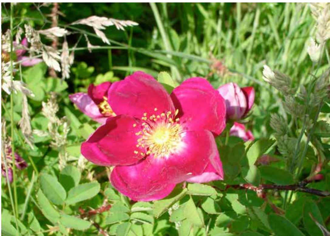
Rosa (Spinossissima Group) "Simon Doorenbos" -A rare Dutch cultivar, not in commerce.