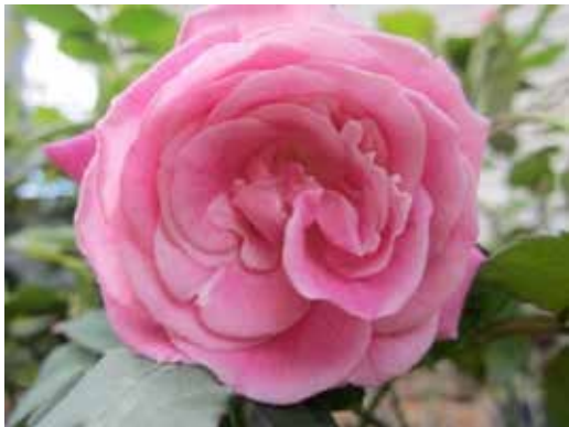
'Beauty of Rosemawr'