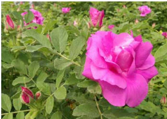
Rosa rugosa 'Double Red rugosa 'Meigui', first appeared at least 1000 years ago

Morphologically, the ancient paintings of Rugosa roses never showed any forms or varieties whose peduncles or calyxes possessed soft or hard prickles. The main characteristics of all double magenta/red form of Rugosa roses among the ancient paintings are very similar, with the features of broad and film-like stipule, with one to three blossoms, smooth peduncle and calyx, double magenta flower, upright bush, and repeat flowering . They are nearly the same as the existing old variety called Rosa rugosa 'Double Red Meigui.'