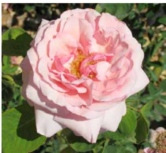
'Lady Alice Stanley'

McGredy in 1909 introduced the hybrid tea 'Lady Alice Stanley', a fragrant rose that, like 'Lyon Rose', can be grown successfully in pots. It unfolds to about 75 petals, essentially a soft pink with some coral-rose and pale incarnadine shades. Bred at a time before the hybrids of hybrid teas, it reaches a perfection that understandably made it a great exhibition rose during the Edwardian Era and afterward. Lady Alice herself, daughter of a duke and a countess, became Countess of Derby when Lord Stanley inherited his father's title in 1908. From 1900 to 1910 she served as one of Queen Alexandra's ladies-in-waiting. The Derby family had a long tradition of