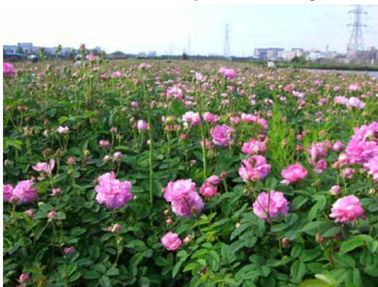
'Tuwei' cultivation for production of wine for more than 600 years.