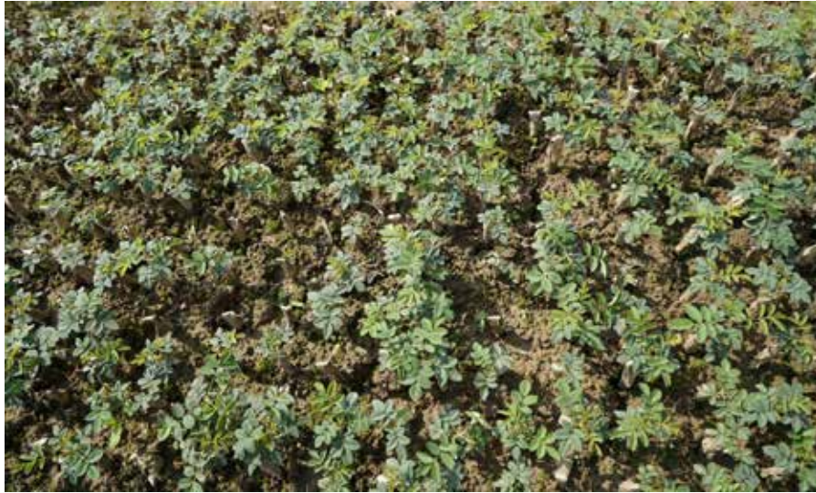
The grafted roses of Tuwei grown for wine use Lichun as their rootstock

Finally, how do we distinguish 'Tuwei' from the old Rugosa varieties? The historical 'Tuwei' is a middling tall, almost upright bush, producing nearly round buds and double flowers with rosy-colored petals. The plant has dark green leaflets, bristles, and prickles, especially on the peduncle and calyx, a classic Rugosa -like smell sweetly tea-scented, and narrow-broad stipules with glandulous hair.