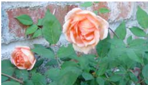
‘Comtesse du Cayla’