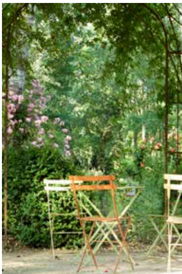
"La Roseraie: Les Chemins de la Rose

We have used these methods through years of trials and errors, refining as we went along. The satisfaction of our partners and customers attest that we are doing something right. But we are also well aware that each region of our vast globe has favored plants used in combating various ailments, be they human or horticultural. In order not to deplete natural resources of a particular plant as well as to increase our knowledge of various plants, we urge you to carefully experiment with purines and let your local rose society know of your results. We are, regardless of where we live, all concerned about the health both of our environment as well as that of our roses