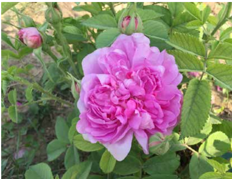
'Tuwei', a Chinese Song Dynasty's variety, well-documented, derived from Rugosas, but very different in its parentage

For most rosarians who visited the Chinese Heritage Rose Garden while attending the 2016 WFRS Regional Convention and 14 th International Heritage Rose Conference in Beijing, the most impressive of the rare heritage roses very likely was 'Tuwei', or 'Tu Wei', 荼薇 in Chinese.