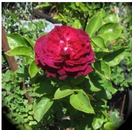
'Arthur de Sansal' Cochet, P. 1855

Four roses of 1855 remain on the market, all Hybrid Perpetuals, the popular rose class of the time. One of these is 'Arthur de Sansal'.