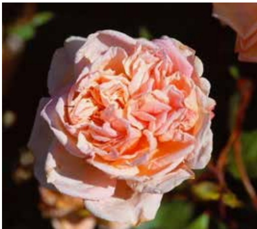
‘Souvenir d’Elisa Vardon’ Marest 1854

In the year 1854 the first telegraph line opened in Australia; Britain and France declared war on Russia, thus beginning the Crimean War; and the Kansas-Nebraska Act left the issue of slavery up to popular vote in that territory, creating violence among its populace, apprehension among international cotton traders who foresaw the handwriting on the wall, and outrage in the North, which then became strongly anti-slavery. The Crimean War demonstrated just how linked and global the world was becoming. Ten thousand Colt revolvers were sent to the war front; about forty doctors from the States worked as medics in the Tsar’s army, and 500 Americans served with the Russians.