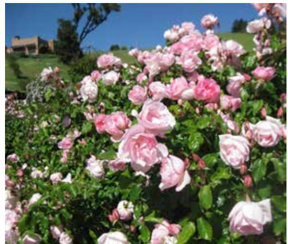
'Duchesse de Brabant' Bernéde 1857

One remaining rose of that year is 'Comtesse de Labarthe', a Tea with a second name: 'Duchesse de Brabant'. This rose is a survivor. It has been discovered growing through drought and neglect in pioneer cemeteries, abandoned homesteads, and Gold Rush towns in California time and again. It should be no surprise that it has earned the Earth Kind certification for roses of stalwart endurance and health. Its cupped blooms look shrimp pink, silvery pink, or soft rosy pink, with concave petals, quite fragrant. The bush grows to five or six feet high and about as wide, densely branching and twiggy in habit.