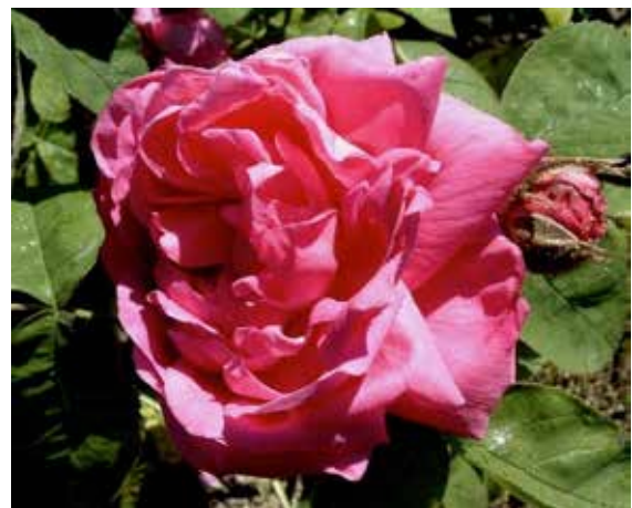
'Comte de Nanteuil' Quétier 1852