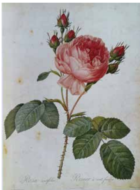
Rosa centifolia foliacea P.J. Redouté ~ Les Roses

Myth, legend, fable, or in newspeak, “misinformation.” As one of the world’s most beloved and oldest flowers, roses abound with such tales: the “twice blooming rose of Paestum”, the fair Rosamund/Rosa Mundi stories, the Lancastrians and Yorkists riding into battle with roses on their doublets. All have been given credence by authors who, like Winston Churchill, in his “History of the English Speaking Peoples,” regarded the Rosamund legend(s) as an “excellent tale”.