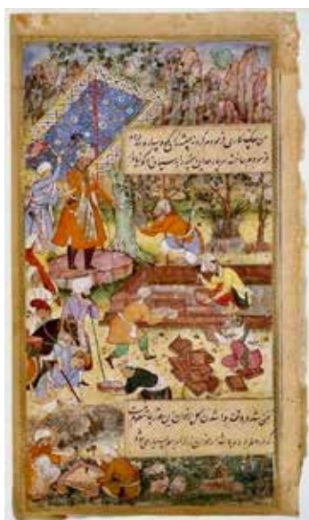
Babur inspecting the making of a garden.

While the Sintra Prashasti tablet, dated to 1287 CE, is the earliest written evidence that roses may have reached India from other lands, in ancient India where history was never documented but was invariably only passed on by oral tradition, it is difficult to be precise. From earlier times there are references to roses for the treatment of various illnesses and ailments in the ancient treatises on Ayurveda , the Indian system of medicine, by medical practitioners like the surgeon Susruta (c. 6 th century CE) and the physician Charaka (c. 4 th century CE). The “Arkaprakash” text mentions the discovery of rose water by the Buddhist monk Nagarjuna. These roses could be both the indigenous species in the Himalayas and those which may have come in from other lands, since there was trade between India and adjacent countries from earliest time and pilgrims traveling from region to region.