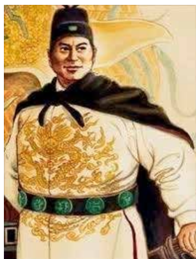
Sketch of Zhen He

Vijayanagar was the capital of the great empire of the same name which ruled south India between 1300 and 1500 CE. Two Portuguese travelers, Domingo Paes and Fernão Nuniz, wrote about the king being garlanded with white roses and his palace being decorated with white roses during a festival called Dassehra , which falls in October every year. Surely these must have been repeat flowering roses. Both Paes and Nuniz as also Duarte Barbosa in his "Travels" memoir (c. 1516) wrote about the bazaars being flooded with roses, used by both the aristocracy and the poor in their daily lives.