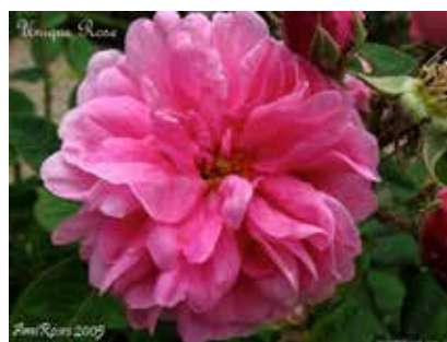
'Unique Rose' Cels prior 1810 © Etienne Bouret

Some rose writers have expanded on the second part of Peter Beales' citation above and declared that our "modern" Centifolia, the Cabbage Rose, could not be the same rose as that described by Theophrastus and Pliny because of its apparently complex parentage. Again, citing Byrne: "The only definitive way to know if the modern centifolia is the same as (or different than) that of Pliny would be to compare them directly". In other words, a "complex hybrid" (if indeed that is what it is) such as the Cabbage Rose could have originated 2 millennia ago as readily as 400 years ago.