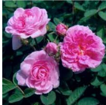
'De Meaux' prior 1637

What then of the Pompon Centifolias? 'Rose de Meaux' came into being c. 1637 and 'Pompon de Bourgogne' (Burgundian Rose) in 1664. But from where? From the supposedly sterile Cabbage Rose, whose growth habit is dramatically different? If so, crossed with what? Both have generated a great number of opinions over the years as to their origins and heritage. At present the site HelpMeFind.com classes the former as a Centifolia/Hybrid Gallica, and the latter as a Centifolia, while Modern Roses has them as a Centifolia and a Gallica respectively.