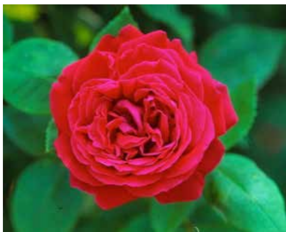
'Empereur du Maroc' Guinoisseau 1858

At least seven roses from that heady year have survived. Three of those are Hybrid Perpetuals, three are Tea roses and one is a Noisette—'Céline Forestier'— the most popular being the Hybrid Perpetual 'Empereur du Maroc'. It is still sold globally by nineteen rose nurseries, only one of which is in the USA. A stunning rose, it is one of the darkest crimson-maroon roses, verging on black, ever raised (until 'Nigrette' of 1934), aging to purple. The foliage, however, leaves something to be desired, for it is sparse and given to black spot. But it remains popular for the beauty of its incredible color, form, and scent.