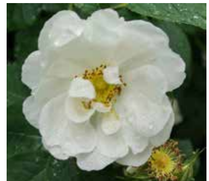
Rosa alba ~ ‘Sappho’ http://roses.shoutwiki.com/wiki

If Zeus chose us a King of the flowers in his mirth, He would call to the rose, and would royally crown it; For the rose, ho, the rose! is the grace of the earth, Is the light of the plants that are growing upon it! For the rose, ho, the rose! is the eye of the flowers, Is the blush of the meadows that feel themselves fair, Is the lightning of beauty that strikes through the bowers On pale lovers that sit in the glow unaware. Ho, the rose breathes of love! ho, the rose lifts the cup To the red lips of Cypris invoked for a guest! Ho, the rose having curled its sweet leaves for the world Takes delight in the motion its petals keep up, As they laugh to the wind as it laughs from the west.