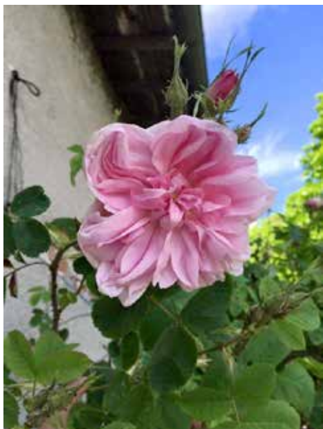
R. x damascena 'bifera'