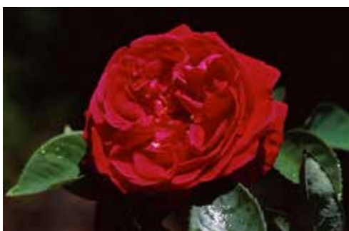
'Général Jacqueminot' Roussel 1853 ~

The famous dark red Hybrid Perpetual 'Général Jacqueminot' came out in 1853. In that year the first railway opened in Bombay, Commodore Matthew Perry arrived in Japan, and anticipation of the Crimean War had England requisition steamships and clipper ships, thus halting trade and migrant settlement in Australia. Exports of wheat from the U.S. to England, however, continued to thrive. By that time, Général Jacqueminot the man had become a Viscount.