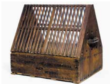
Picture of a Wardian Case

Rosa x damascena var. bifera , the Autumn Damask. Since this rose is also of Persian or Middle Eastern origin, it is reasonable to conclude that this too was brought by the Mughals. The Mughal realms included the region of Kashmir, which lies immediately adjacent to Afghanistan, and in the mountains of Kashmir we have the typical roses of Persia: the two “golden species” Rosa foetida and Rosa ecae , where they can still be found.