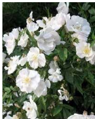
Rosa moschata nastara

Coming to the Mughal Empire, from 1500 CE onwards, the first emperor of this dynasty Babur in his autobiography “Baburnama” wrote of introducing the musk rose from Persia (Iran) into India, along with the narcissus. Babur had his roots in central Asia, from where he invaded India, and the musk rose he refers to is Rosa glandulifera , now re-named Rosa moschata nastarana, the Persian form of the musk rose. Although there are no further written references to rose introductions during the Mughal period, all the emperors and their courts, as is obvious from many court paintings, had and loved formal gardens of roses and other plants.