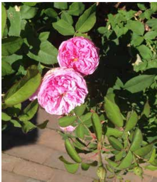
'Mme Boll' Boll 1859 ~

The end of that decade saw the release of four roses that have survived into our times: 'Comte de Chambord', 'Mme de Tartas', 'Victor Verdier', and 'Mme Boll'. Because it is the one least discussed in the literature, I will focus on 'Mme Boll'. Like so many heritage roses, it is far more popular abroad than in the U.S.