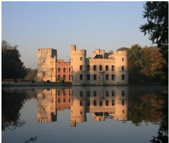
The Castle of Bouchout

Meise Botanic Garden has a long history, its origins going back to the late 18th century. Originally, the garden was under private ownership and as the owners changed so it moved from one location inside the city of Brussels to another, acquiring a different name each time. In late 1938, the Belgian government had purchased an estate just outside the Brussels area with the purpose of assigning some 90 hectares to an official State Botanic Garden (Jardin Botanique de l'Etat/ Rijksplantentuin), to which plants and part of the greenhouses were to be gradually transferred from the Brussels Jardin Botanique. It was assumed that hard work would result in a quick and dramatically needed transfer of the Botanic Garden to its final and present location, the Bouchout Domain in the Town of Meise. From the very beginning, when considering a transfer to the Bouchout Domain, Dr. Walter Robyns, Director of the State Botanic Garden, drew up a plan that included all the attributes of a model garden: the State Botanic Garden was to comprise of a rose garden, space for aquatic plants, commercial, systematic and ecological collections, a horticultural arboretum and fruticetum, a systematic herbacetum, a systematic fruticetum, a systematic arboretum, a palace of greenhouses, propagation greenhouses, an alpine garden, aspects of Belgian vegetation, an Italian garden, a collection of rhododendrons and bamboos; aquatic scenes and experimental and nursery cultures.