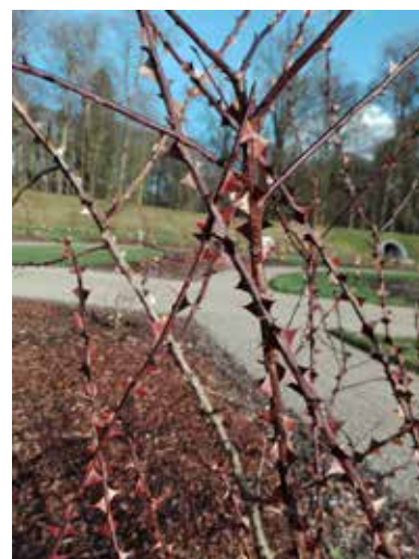
Prickles of Rosa sericea

The introduction of Chinese roses into the western world towards the end of the 18th century is probably the most important contribution to rose cultivation. Chinese roses caused a change in the gene pool, which allowed new forms of roses to be created, for when the first Chinese roses were imported into Western Europe, between 1792 and 1824, they included ancient Chinese roses Rosa x chinensis and three forms of the Tea roses ( Rosa x odorata ). The continuous flowering character of the Chinese roses was a characteristic that was lacking in the old European garden roses. Also the pointed buds and curling petal tips that are so characteristic of many modern roses come from R. x chinensis . However, Chinese roses are less cold resistant than the European roses and also much less fragrant.