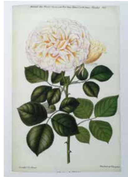
'Gloire de Dijon' Journal des roses 1877

From the 18 th century, their ornamental features won over amateurs and have been present in our gardens. Let us look at these species and their cultivars.