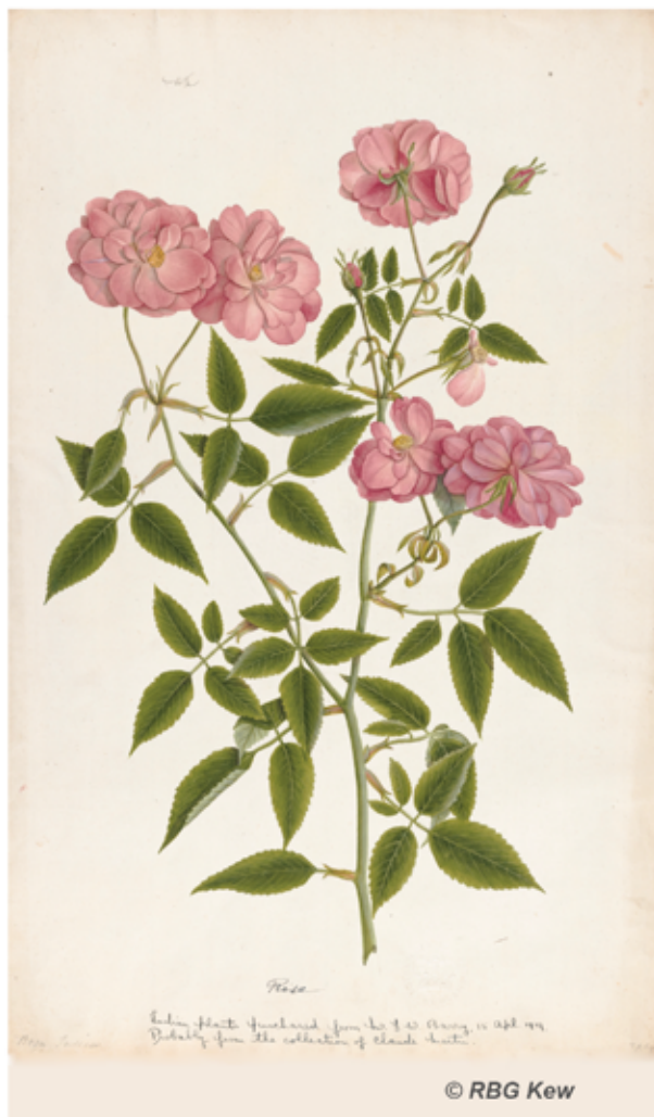
Rosa sp. painted for Claude Martin