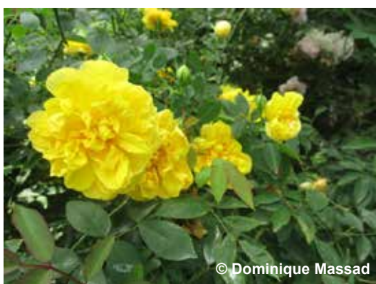
Rosa foetida 'Persian Yellow'

Rosa foetida 'Bicolor', sometimes called Rosa punicea , and known since the 16 th century, is remarkable for possessing blooms whose petals are a nasturtium red but whose reverse is yellow. Often canes are covered with only yellow blooms which indicates that the bi-color trait is probably due to a natural mutation. It is an easy rose to grow in warm conditions.