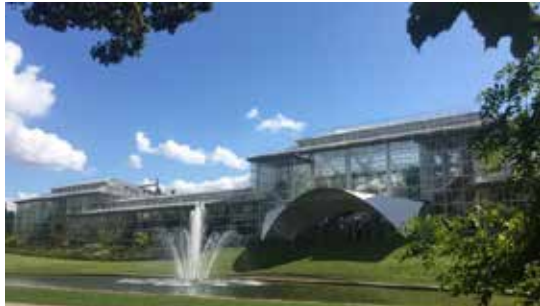
Entrance to the Plant Palace

garden should focus on wild roses (species roses, botanical roses). The collection managers started gathering wild species from all over the world, preferably wild collected material with origin data. Thirty eight years later, in 2017, the concept and design were drawn. Finally, on 5 June 2019, the rose garden of Meise Botanic Garden was officially opened.