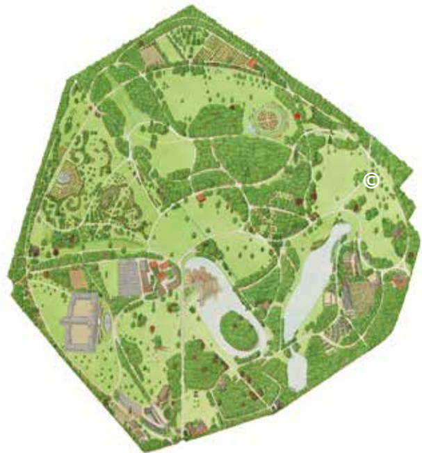
Layout of Meise Botanic Garden

It is staggering how well-known garden roses are to the public, but how little is known about wild roses. Wild or botanical roses are the species as they occur in nature. Depending on the source, there are between 150 and 250 wild roses known of which we have currently about 100 in the Botanic Garden. Our main goal is to highlight the botanical roses and their evolutionary story. Where did they originate? Where do we find them geographically? How can we recognize different groups? These are all questions