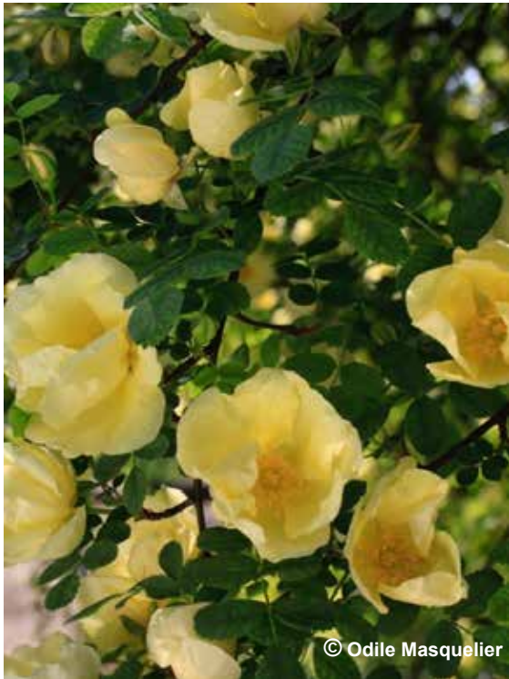
Rosa xanthina sp hugonis