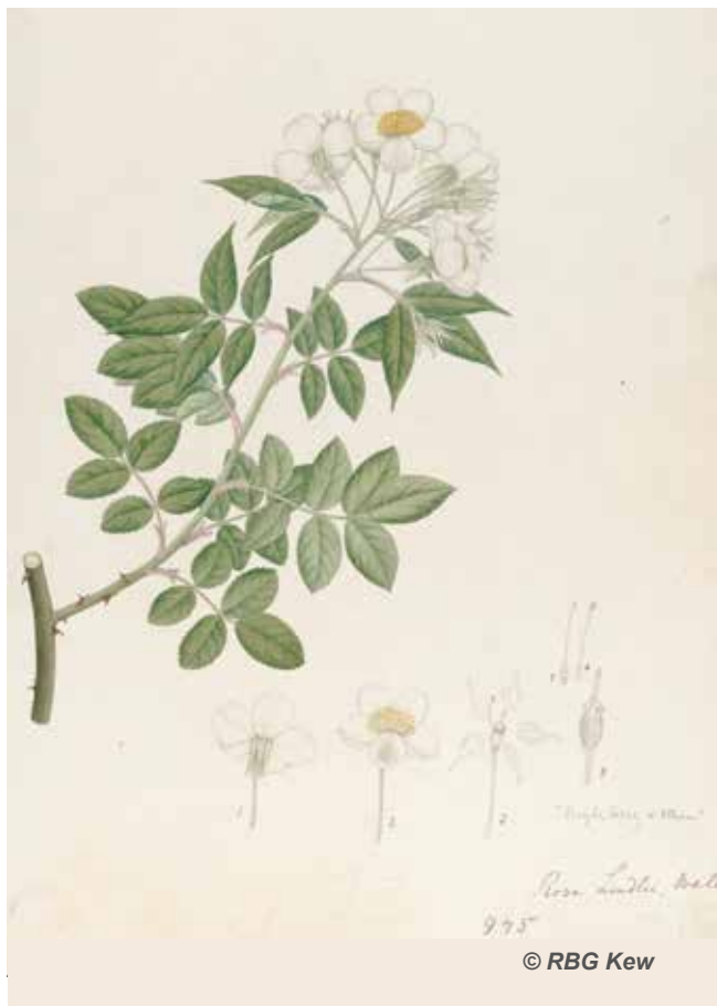
Rosa moschata labelled as R. lindleyi Painted for Nathaniel Wallich