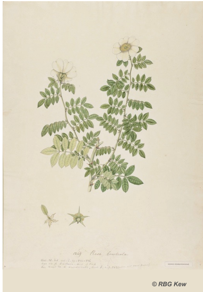
Rosa clinophylla labelled Rosa bracteata Painted for William Roxburgh

There is no time to do justice to Roxburgh here, but he is well known and it seems more worthwhile to introduce some lesser-known figures. However, as an example of a horticultural plant included in the Icones , one can take the striking painting of the traveller's palm ( Ravenala madagascariensis ). Though native to Madagascar the plant was introduced to the Calcutta Garden from Mauritius by a Captain Tenant in 1802 and flowered in 1806 and 1807. Some agricultural species are also included in the Icones , including two species of sugar cane, Saccharum officinarum and S. sinense . Sugar was a major crop plant in which Roxburgh took a great interest and imported new varieties from abroad. S. sinense was sent from Canton in 1796 and Roxburgh had hopes that its harder stems would 'resist the forceps of the white-ants and teeth of the jackal' better than existing cultivated Indian forms of S. officinarum . It is now thought to be a hybrid between sugar cane and its wild relative S. spontaneum .