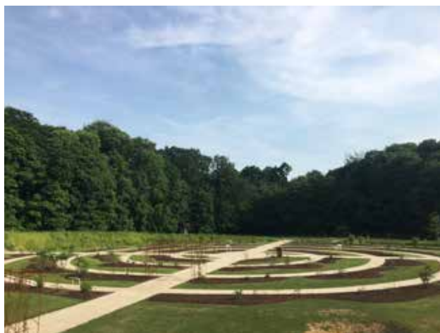
Picture of the Rose Garden when first planted

In Belgium, 19 species of wild, non-invasive, roses can be found. Of these only two are common, the other 17 are rare to very rare. Although most of these species are already present in the garden, we will try to collect material of all these species (and their varieties) to give the public an overview of the diversity we have in Belgium. Furthermore, this is of course of importance for the conservation of the genetic material of these plants. An example of a very rare plant in Belgium is Rosa subcollina . This species occurs almost everywhere in Europe, however, in Belgium only one locality is known. If plants at that locality disappear, this genetic material is lost forever, so it is of utmost importance for us to have this valuable material in our collection. Luckily, we have.