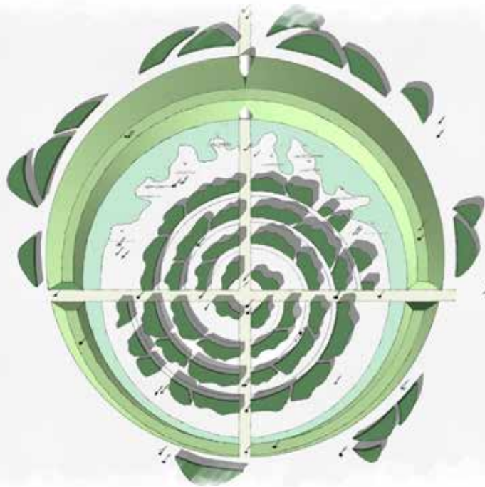
Map of Rose the Garden

Clade B is represented by seven section in the second spiral: R. sect. Microphyllae ( Rosa roxburghii ), R. sect. Bracteatae (e.g. the tropical Rosa clinophylla ), R. sect. Laevigatae ( Rosa laevigata ), R. sect. Banksianae (e.g. Rosa banksiae f. normalis ), R. sect. Synstylae incl. R. sect. chinensis (e.g. Rosa gigantea ), R. sect. Gallicanae (e.g. Rosa gallica ) and R. nothosect. Caninae (e.g. Rosa corymbifera ). The nothosection Caninae is further divided in six subsections and almost all known taxa are represented in the garden. This is probably our most valuable rose collection since most of the Caninae material is wild collected.