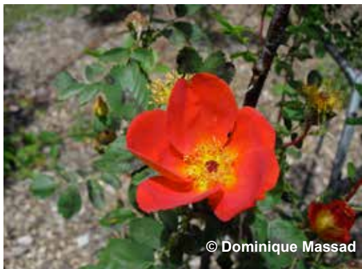
Rosa foetida 'Bicolor'

Rosa foetida 'Bicolor', sometimes called Rosa punicea , and known since the 16 th century, is remarkable for possessing blooms whose petals are a nasturtium red but whose reverse is yellow. Often canes are covered with only yellow blooms which indicates that the bi-color trait is probably due to a natural mutation. It is an easy rose to grow in warm conditions.