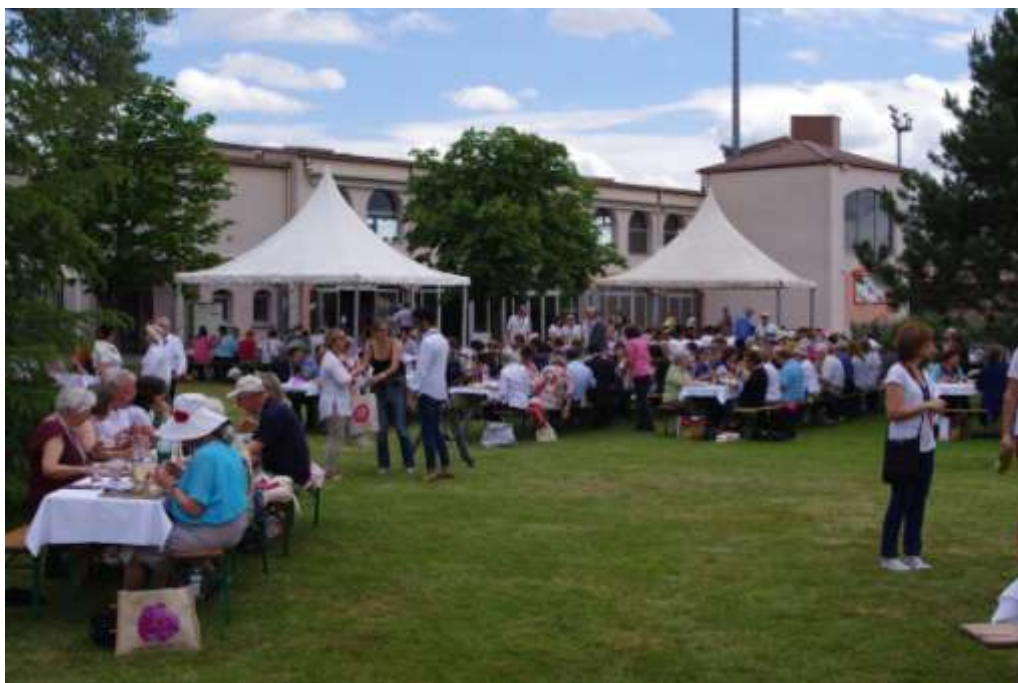
Picnic lunch “on the grass”