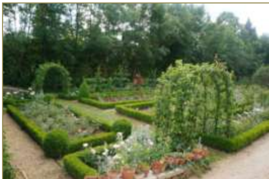
Château St. Bernard hedged rose garden and arched pear trees