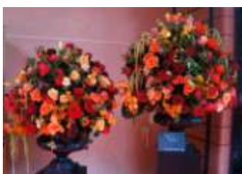
Beautifully arranged roses at the entrance to the Finger Buffet function, which took place on the evening of Wednesday 27 th May. Original foods and wines from the Rhone-Alpes region were served.