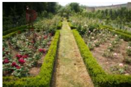
Château St. Bernard Rose Garden