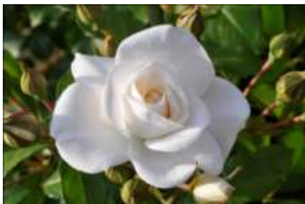
No. 140 "La Palme du Rosier á Massif" - for the best Floribunda Prague ® Castle ® Poulcas 043 Breeder: Poulsen, Denmark