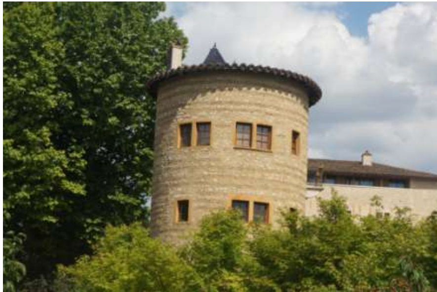
Rear view of Château St. Bernard

CHÂTEAU SAINT BERNARD is a 13 th century castle, located on the banks of the Saône River approximately 20 km north of Lyon, The castle's restoration commenced in 1996 and in 1997 it was classified as an Historical Monument. The Gardens of Saint Bernard Castle are composed of three parts: the main garden consisting of twelve small theme gardens, including more than 600 apple and pear trees; the rose garden which connects the two main parts of the garden; and the nearly 500,000 daffodils in spring;