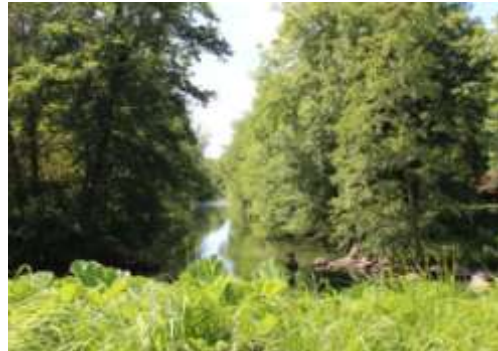
Loiret River meanders through the park