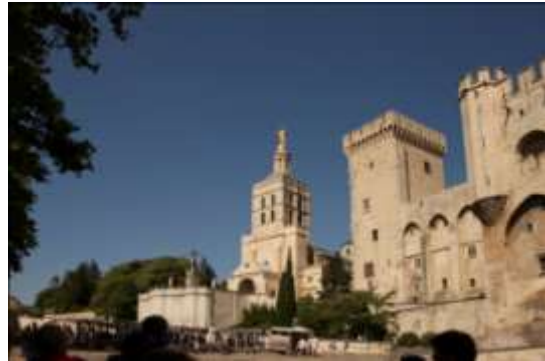
Palais des Papes

Then we visited the historical city Avignon with lots of churches, chapels and splendid medieval buildings. The most impressive is the gothic Palais des Papes with an area of 15,000 square metres - one of the largest medieval buildings in Europe, with its towers rising up to 50m high. Avignon is also called City of the Popes, because from 1309 until 1423 Avignon was the residence of popes.