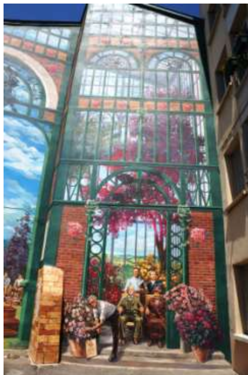
Fresco depicting the four generations of the Laperrière family