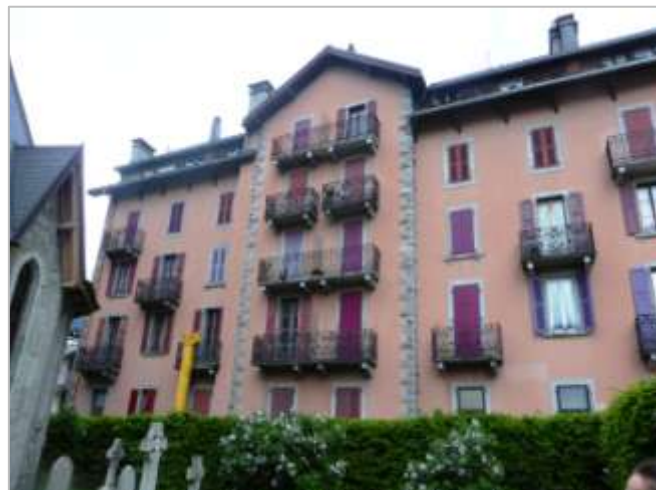
Interesting balconies seen from the bus along the way

This tour can best be described as “50 shades of green – and not a rose to be seen” – well not quite, but nearly. A pick-up time of 06.30 at the Best Western and then a circuitous route to the Congress wasn't a bright start, but then we were off driving along the promenade alongside the Rhone on a glorious sunny morning, admiring the beautiful wrought-iron balconies of the apartments.