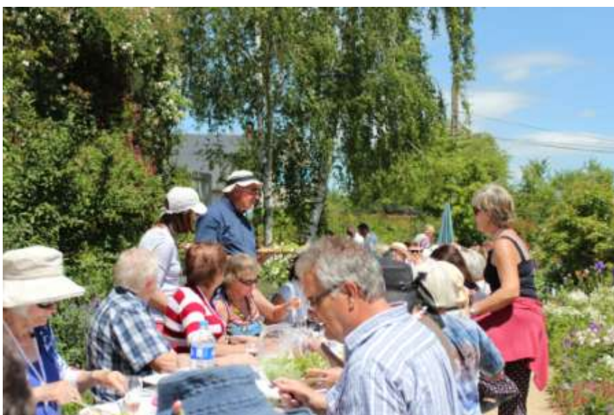
Lunch in the garden of André Eve

Food and wine flowed from the kitchen – tray after tray of delicious hors-d'oeuvre, entrees and desserts - enough to satisfy any appetite.