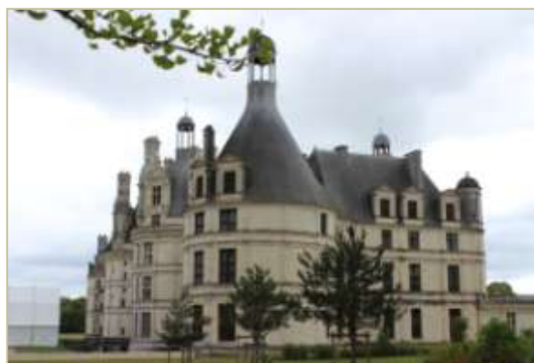
Château de Chambord

Next stop - Château de Chambord is the largest of the Loire castles. In 1516, Francois I, King of France, came back from Italy with Leonardo da Vinci with a desire to create a large pleasure palace, symbolic of his power. Since Leonardo da Vinci died in 1519, mystery still swirls about the extent of his involvement in the castle design. But some of the unique architecture, such as the positions of the double helix staircase, openings are included to provide a flow through the building and the presence of vaulted ceilings on the second story are many touches that appear to be da Vinci's.