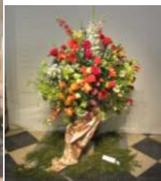
An interesting and innovative rose arrangement exhibition was enjoyed by the delegates