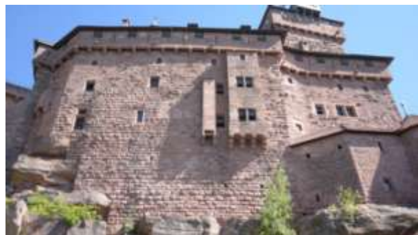
Chateau du Haut-Koenigsbourg - Strasbourg