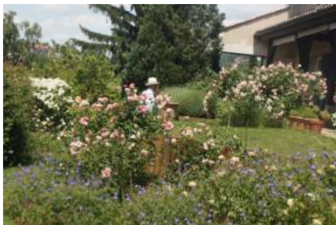
Bernard Tuaillon's Garden