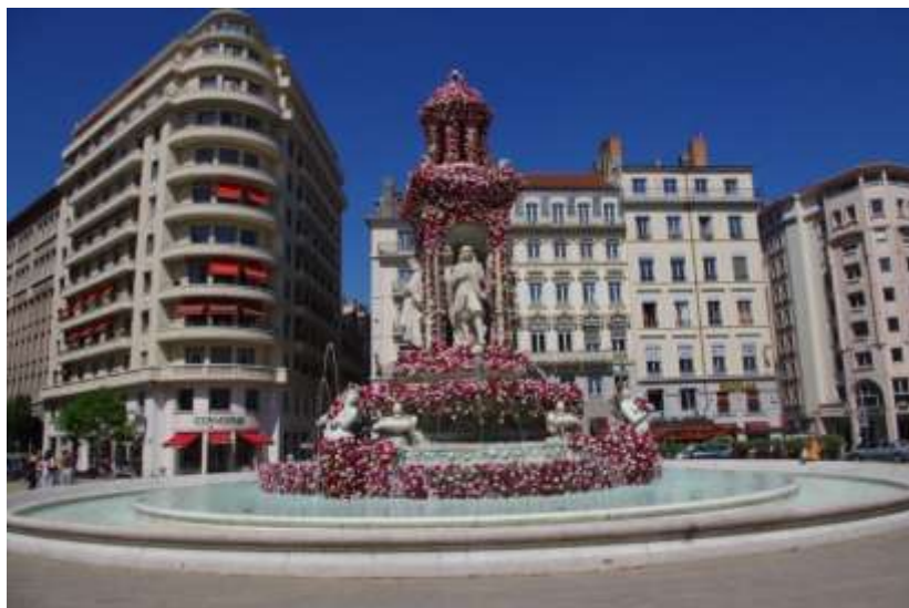
Place de Jacobins

In the centre of Lyon – wonderful city! In the basin in Place de Republique carpets of roses were floating and even the blue lion had been decorated with a necklace of roses, but the most spectacular view was definitely the fountain at Place des Jacobins.