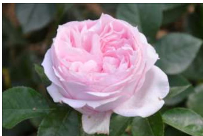
No. 126 Prix "Armand Zinsch – Prestige de la Rose" - for the best Hybrid Tea Rose Chateau Barbeyrolles® Lapbar Breeder: Laperrière, France

Four special prizes were awarded which were based on the judging of the international jury: