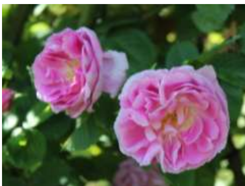
'Celine' - 1826