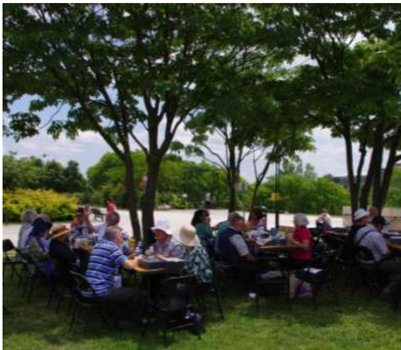
Lunchtime in the Roserie de Saint-Clair

Saturday, 30 th May - This afternoon the theme was Rose Gardens and Parks . We were taken by bus to Roserie de Saint-Clair in Caluire et Cuire which was on the other side of the Rhône just opposite the Centre de Congrès. Tables and chairs had been set up in the shade of some trees: Lunchtime. And what lunch-boxes the French can come up with! Super!!!