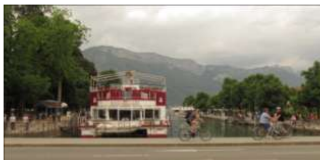
The boat 'Libellule' moored at the Quay Napoléon III

In the park close to the town, the 50 th International Volleyball Tournament was taking place with what seemed to be dozens of volleyball games taking place at the same time. We crossed a footbridge over the canal which contributes to the Annecy's nick-name ' Venice of the Alps ', eventually reaching the Quai Napoléon III where the restaurant boat ' Libellule ' (meaning 'Dragonfly') was moored. We boarded the boat and took our seats in the restaurant for lunch. As we ate, the boat sailed the length of the main part of the lake but some of us felt the need to leave the table at intervals to view the lake and mountain views that we passed from the top deck. It was a tasty lunch but it can be rather frustrating to be expected to concentrate on eating while passing through dramatic scenery that you cannot see properly from the restaurant! Many will have missed a view of the romantic 'fairy-tale' castle, Château de Menthon-Saint-Bernard , dwarfed by the nearby mountain escarpment. I chose to sit on the top deck for the whole return trip.