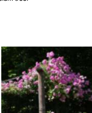
'Ornement des Bosquets' (Jamain, 1860)

Arriving at the rose garden of Monique and Roger Roux in Trept, we again received a very warm welcome. Monique and Roger bought their place in 1992, but it was not until retirement in 2002 that Roger seriously started laying out the rose garden. Next to the house and terrace there was a swimming pool and behind that the garden consisting of a small vegetable garden, a fruit garden and roses in between and everywhere. We noticed with great joy that the Danish breeder Poulsen was represented in the garden with the spectacular climber 'Pink Bells'. Other eye-catching climbers were the noisettes 'Ornement des Bosquets' growing up a pole and climbing along chains and 'Crépuscule' growing next to the pool. The impressive Wichurana climber 'Albertine' filled most of the roof of a garden shed and the lovely multiflora rambler 'Marietta Silva Tarouca' was in the act of conquering a plum tree.