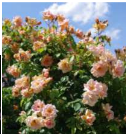
'Crépuscule' (Dubreuil, 1904)