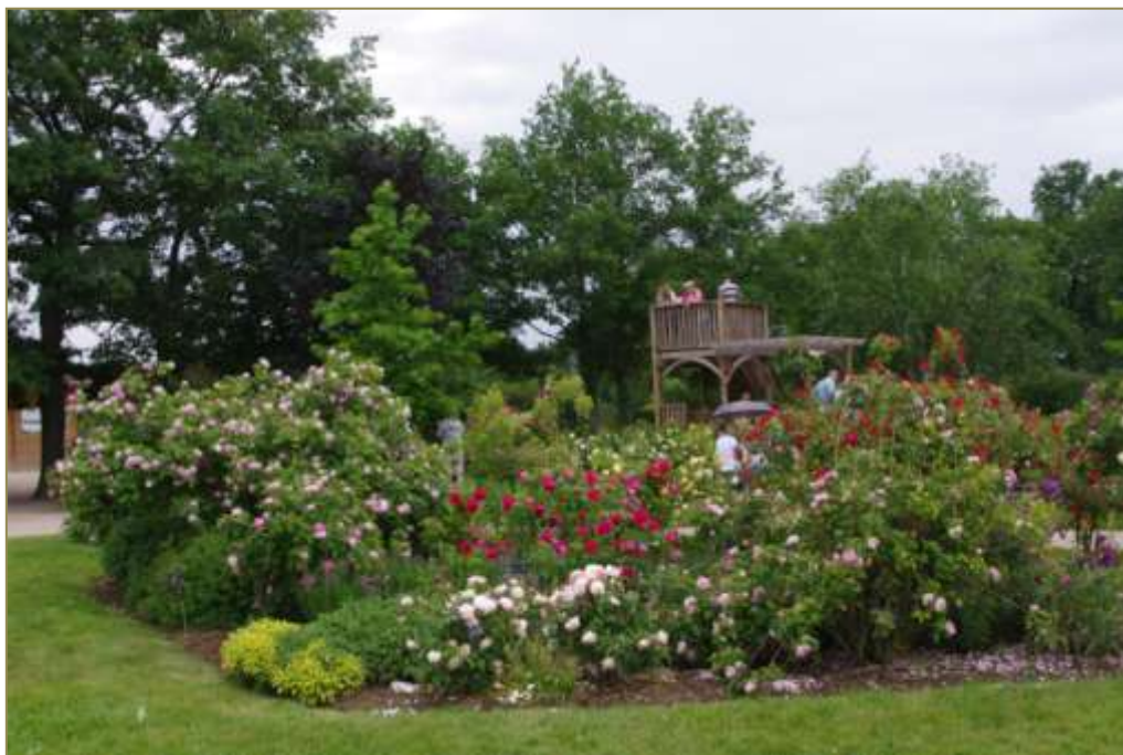
De Roseraie de St. Galmier

in your garden, get out and get it! It is simply stunning. The same goes for the modern, continuously flowering 'Sourire d'Orchidée'. We have it in our garden and love it! A new acquaintance was 'Suzon' reminding a bit of the Lens-rose 'Plaisanterie' with its shimmering colours. Often confused with 'Erinnerung an Brod' (Geschwind, 1884) it was exciting to see the velvet-like 'Souvenir d'Alphonse Lavallée'. 'Roville' – certainly an eye catcher – was one of the last impressions before leaving this wonderful, scent-intoxicating collection of roses.