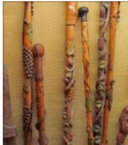
Part of the collection of walking canes carved with grapevines in the museum

After a tiring day with an afternoon wine tasting, many people slept on the journey back to Lyon (about 116km).