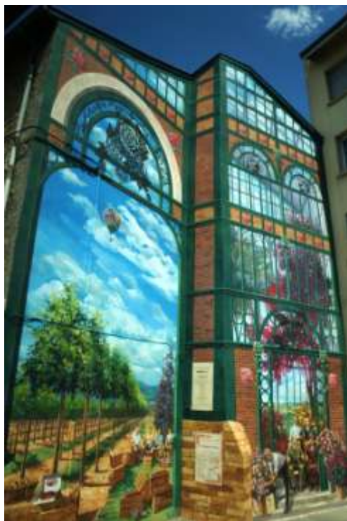
Fresco of roses – a tribute to the rose growers Champagne au Mont d'Or