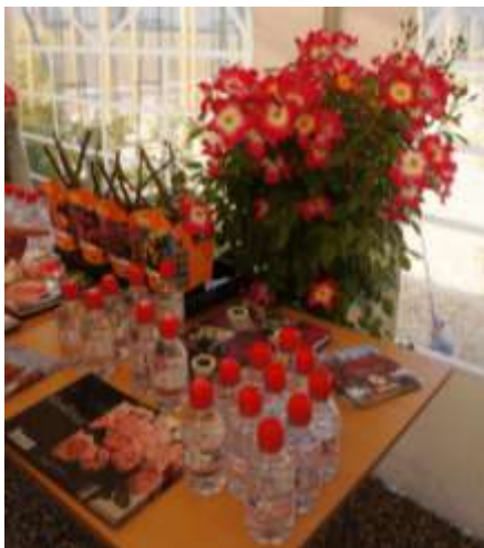
Welcome table with refreshing drinks

ROSERAIE MEILLAND RICHARDIER where delegates were offered refreshing cool drinks before an orientation from a member of the Meilland Richardier family followed by a guided tour of the various green houses and propagation areas.