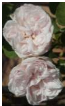
'Souvenir de la Malmaison' 1893