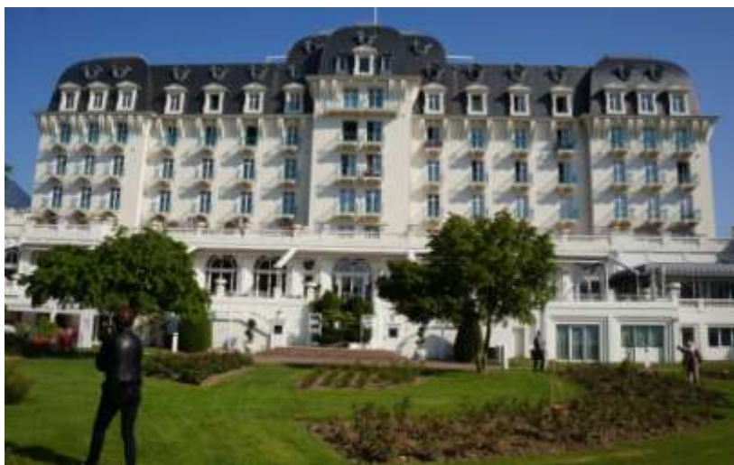
Hotel Imperial Palace