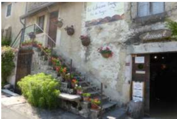
Anxious for flowers – geraniums at the Caveau Bugiste

On to the Caveau Bugiste for wine-tasting with more food, and whilst the historic collection of stone tools, cork screws and liqueur glasses was riveting – and yes, there were some roses in bloom – the grandeur of those giant trees would have to be the ever-lasting memory of this Pre-Convention Tour.