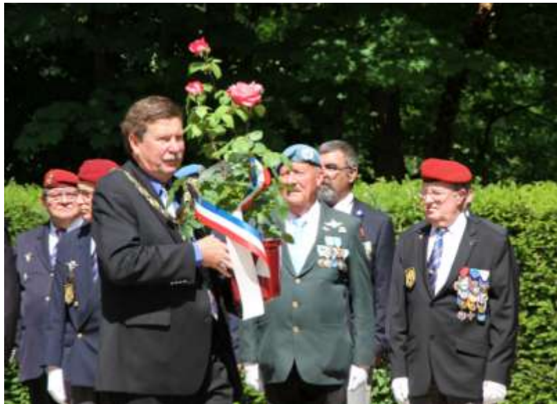
Drakkar ceremony in Lyon