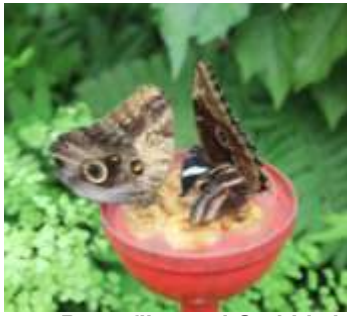
Butterflies and Orchids in the Butterfly House