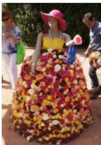
Seen at the Rose Festival in the park