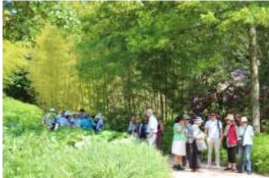
Walking trail through the park