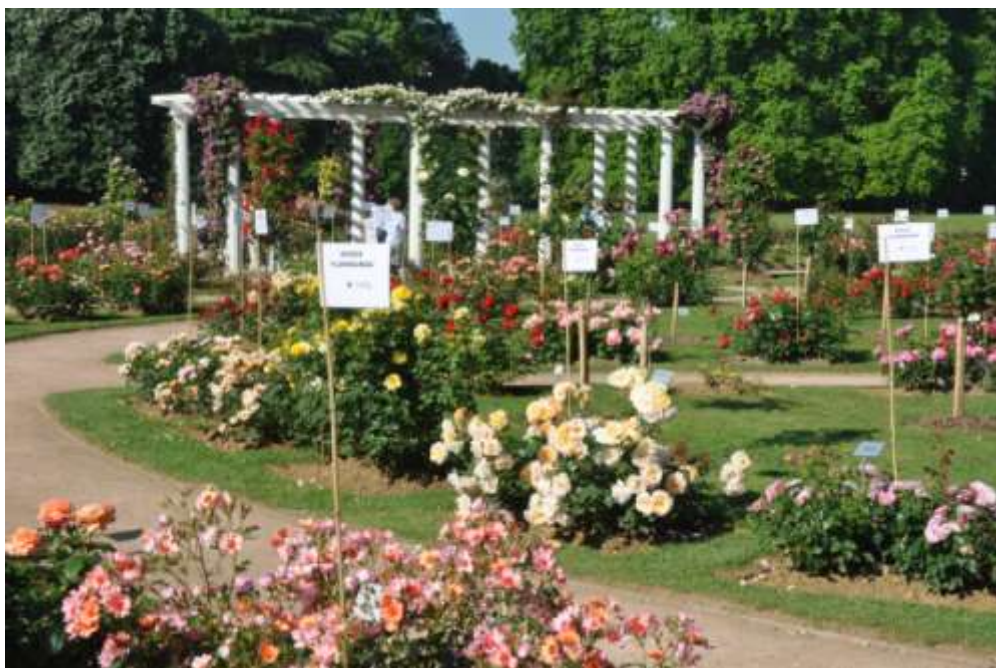
The Rose Trial Garden - Parc de la Tête d'Or

Markus Brunsing – Germany - text and photos