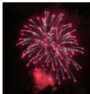
Fantastic fireworks display