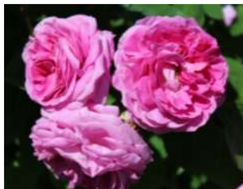
'Baronne Prévost' - 1842