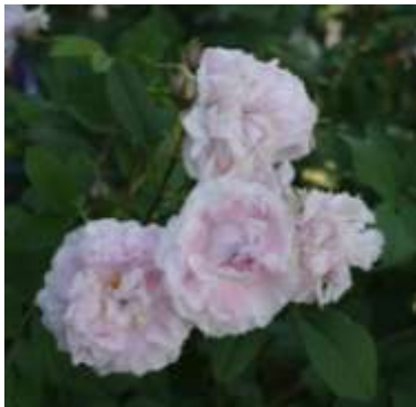
'Martin Frobisher' (Svejda, 1961)

What we had not expected was two Canadian rugosas: 'Martin Frobisher' and 'David Thompson'. They are appreciated roses in Iceland, Norway, Sweden and Finland with their somewhat colder climate, but here in France they looked splendid and thrived well. More noisettes, moschatas and old roses filled this beautiful and very varied garden, a garden with a nice, and cozy straightforward atmosphere.