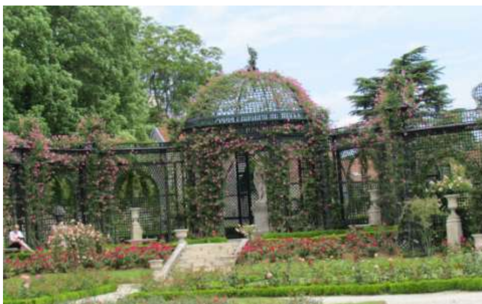
Roseraie de l'Hay du Val de Marne

grown over rows of large arches. Roseraie de l'Hay has the distinction of being the first European garden dedicated entirely to roses, and its 13 areas tell the story of the rose from its Asian beginnings to the present, including sections such as The Garden of Gallic Roses, The Garden of Modern French Roses, and the Garden of Modern Roses.