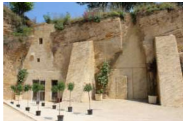
Le Mystère des Faluns lunch tent at Quarry - Rosiers and Fruiteurs Doué La

Pays de Loire, the WFRS post-convention tour, was a class act, made up of great places to visit and proficient- knowledgeable guides, volunteers and bus drivers. There was an abundance of delicious food and wine! We had perfect weather, perfect roses and perfect friends to share the joy.