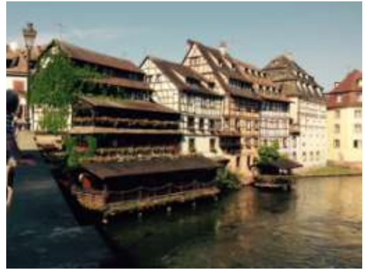
15 th and 16 th century buildings as seen from the boat on the Third River