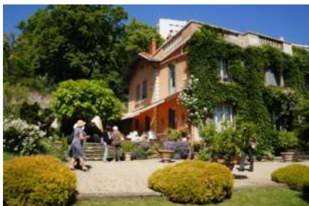
Rear of the house – La Bonne Maison