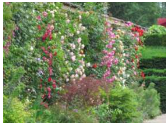
Bagatelle - Paris