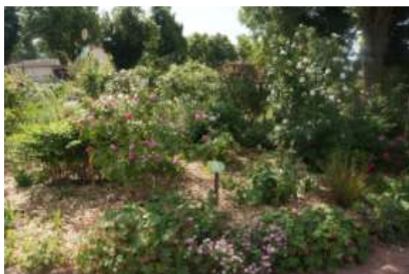
A section of the garden