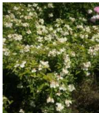
'Banksia Alba Plena' 1807