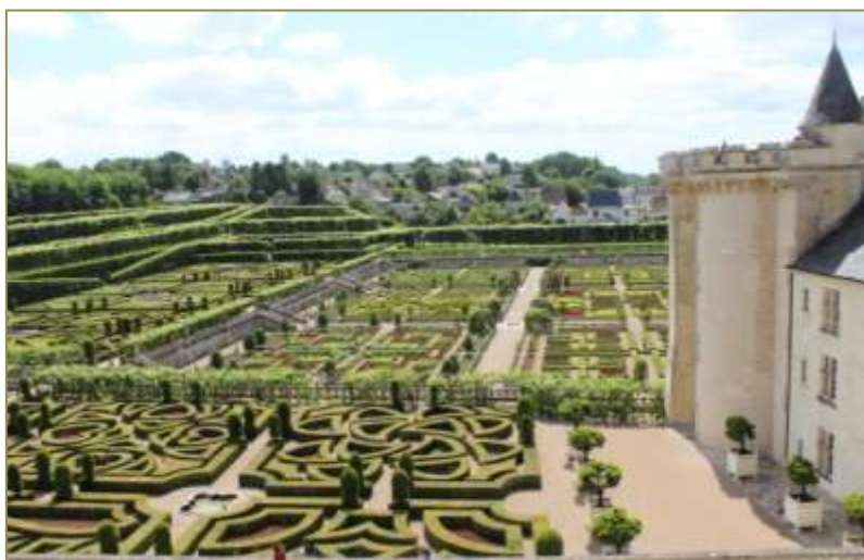
Two of the six gardens of Château de Villandry