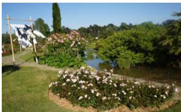
Part of the art exhibition in Parc de la Tête d'Or