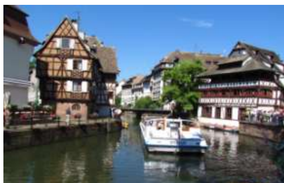
Delegates on the cruise