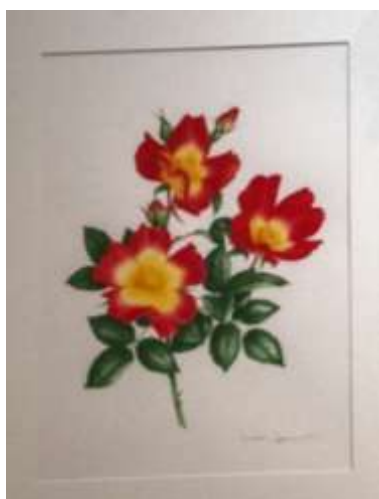
Painting of 'Cocktail'