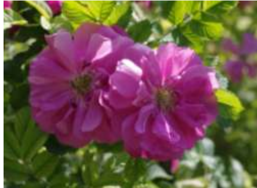
'David Thompson' (Svejda, 1970)

Saturday, 30 th May - This afternoon the theme was Rose Gardens and Parks . We were taken by bus to Roserie de Saint-Clair in Caluire et Cuire which was on the other side of the Rhône just opposite the Centre de Congrès. Tables and chairs had been set up in the shade of some trees: Lunchtime. And what lunch-boxes the French can come up with! Super!!!