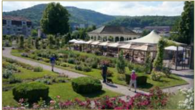
Roseraie de Saverne – France

In Saverne we visited Roseraie de Saverne which dates back to 1898. This is a WFRS Award winning Garden of Excellence (2002). Here we were welcomed by the President of the Rose society and entertained with traditional dancing and supper in the rose garden which was a most enjoyable and fun evening.