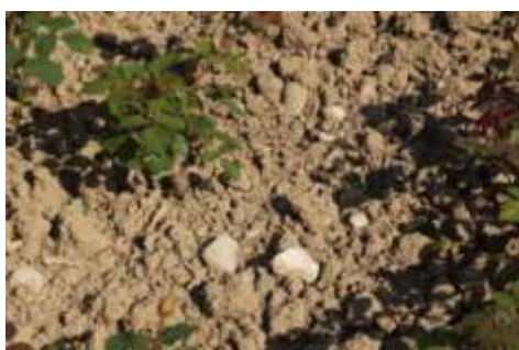
Note the chunks of limestone in the rose garden beds - the soil is quite alkaline