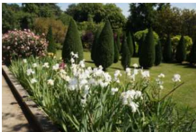
'Raubritter' (Kordes 1936) , 1 of more than 800 varieties labelled in this garden, clipped Cypress trees in the lawn and white irises.