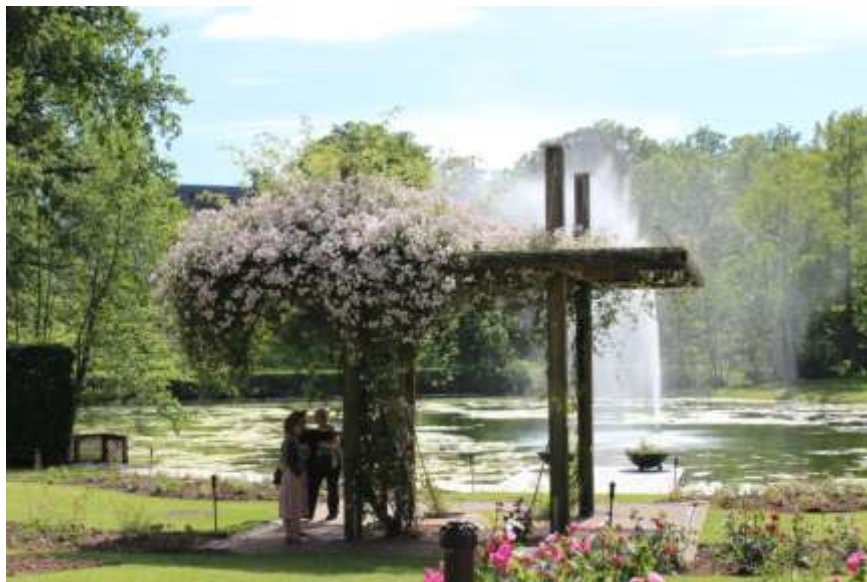
Pergola smothered in roses and clematis