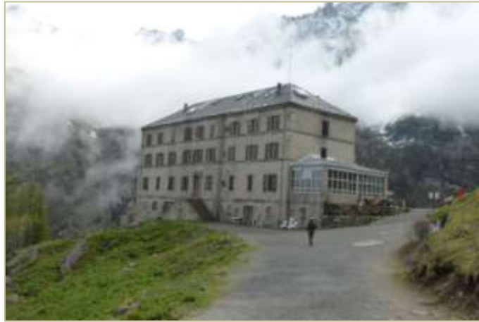
The railway station at Monteverve where some hot coffee was welcome

The glacier is reached by the rack railway of Monteverve, a veritable wonder of engineering, and as we arrived there was a light fall of snow - how is that for someone who "loves a sunburnt country"? Then the sun came out - we walked around the glacier, into the crystal cave, looked through the museum showing early explorers and the workers building the railway and watched a short film. Back onto the bus – and the drive back down the mountain was not for the faint-hearted.