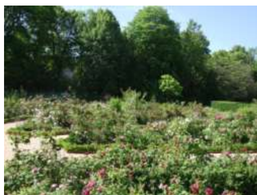
The new Rose Garden at Malmaison