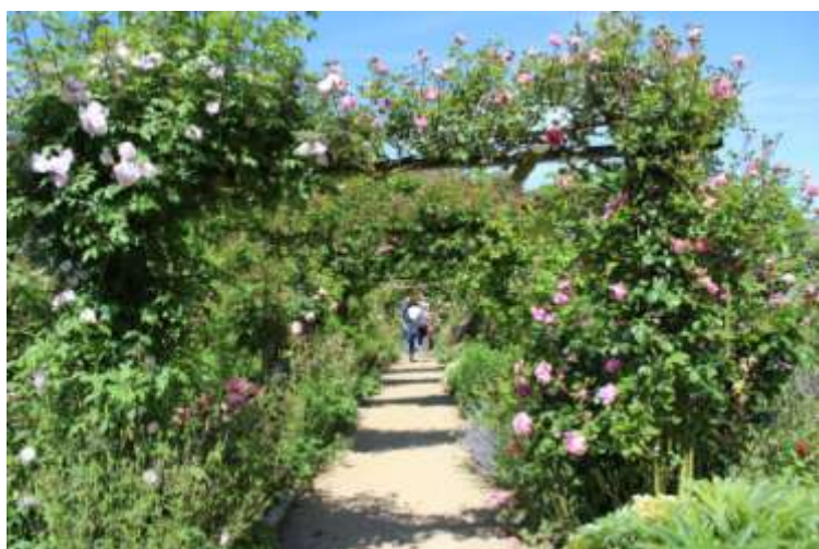
Arbour of climbing roses

We were greeted by a long arbour, simply composed of birch wood that supports climbing roses and clematis. Here we saw some of the most beautiful Old Garden Roses. Andre's garden is a lovely mix of old garden roses, modern roses, perennials and annuals. This must be what heaven looks like.