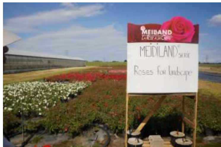
Growing area for Landscape Roses