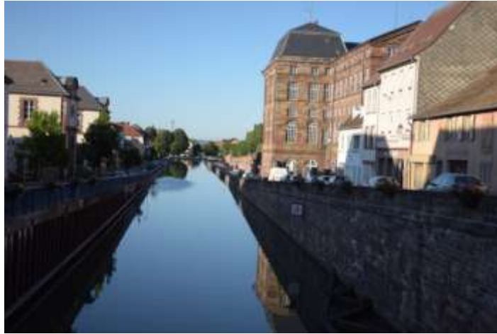
Canal near the hotel Chez Jean on the way to Saverne