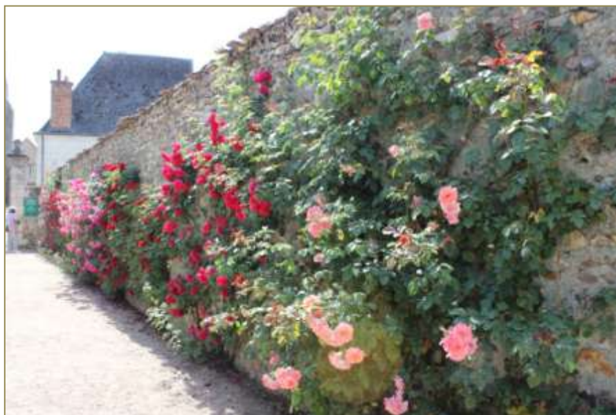
The rose garden – Villandry

Following a busy day of being tourists, we enjoyed another wonderful meal and wine in Nantes. After a good night's rest and breakfast at the Ibis hotel, we departed for Le Parc Floral de la Beaujoire in Nantes. This park offers beautiful views of the Erdre River and, is home to nearly 20,000 landscape roses, 1600 different varieties, along with iris, magnolias, heather and many other perennials. The city of Nantes and the French Society of Roses organise the "La Biennale Internationale de la rose parfumée" in this park. Every other year, the park hosts the only competition of fragrant roses that exists in the world. The jury consists of two panels. A technical jury evaluates the health, vigour and growth of the roses and the second, composed of perfumers, make up the international jury of Great Noses.