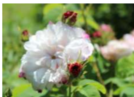
'Léda' - 1826