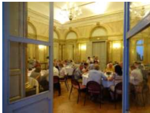
Dinner at the Château de Rohan