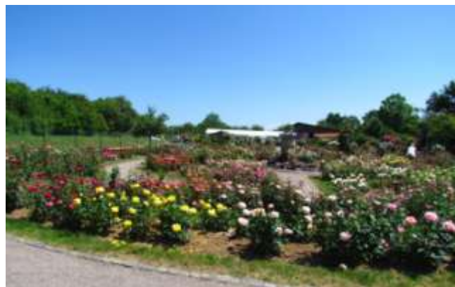
Rosheim Garden