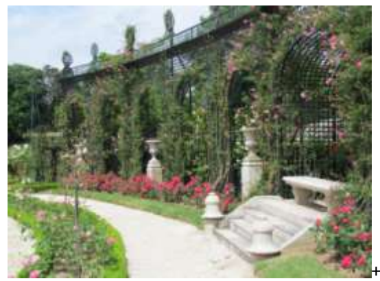
Roseraie de l'Hay du Val de Marne