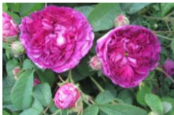
'Charles de Mills' (1790)