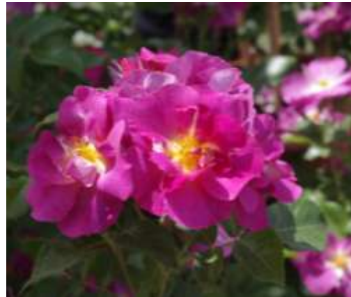
'Chateau de Pupetières' (Felix, 2014)

Walking around watching all the roses and shows I suddenly heard the sound of a street organ. I went after the sound and soon stood in front of a covered stage where five couples dressed in the style of 1890 performed dances from the period. I felt as if I was looking at a Toulouse-Lautrec picture and could not help feeling very lighthearted and happy.