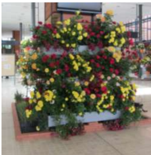
A display of roses at the entrance to the Centre de Congres