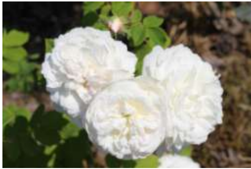
'Mme Plantier Alba'