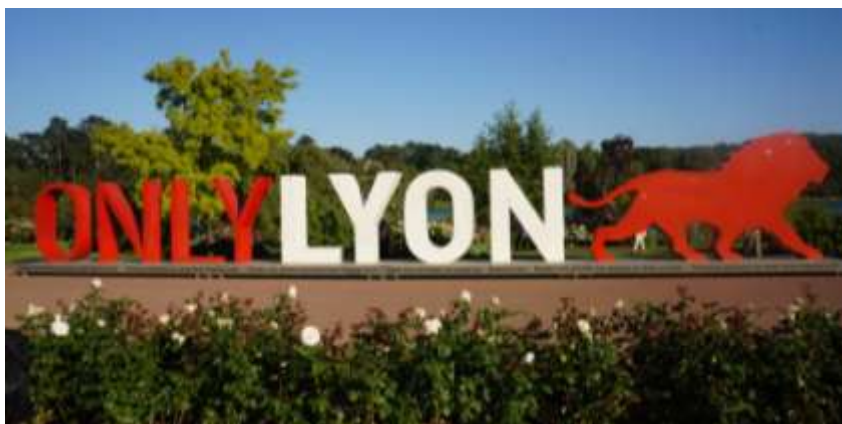
PARC DE LA TETE D'OR

The park is less than 5 minutes walk from the Centre de Congrès in Lyon - the venue for the World Rose Convention. It was part of The City of Lyon's Rose Festival to raise awareness of The Rose and their history. The entire Parc de la Tête d'Or is an area of approximately 117 hectares (290 acres) and within it, is The International Rose Garden of Lyon, inaugurated in 1964, which covers 40,000 sq.m. and has some 30,000 roses of 350 varieties. There are two other rose gardens: within the park - the Rose Garden of the Botanical Garden which traces the history of the rose; and the Rose Trial Garden where the International New Roses Contest takes place each year.