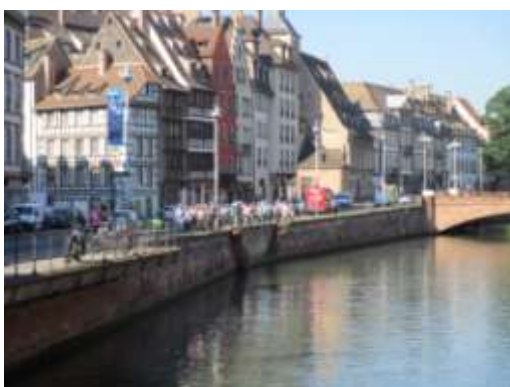
Delegates waiting for the boat in Strasbourg

On the last day we travelled to Strasbourg where we had a 1 hour cruise on the Third River. Strasbourg is the seat of the European Parliament.