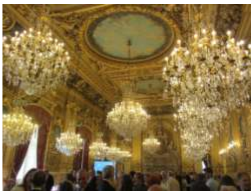
The regal interior of the Hotel de Ville