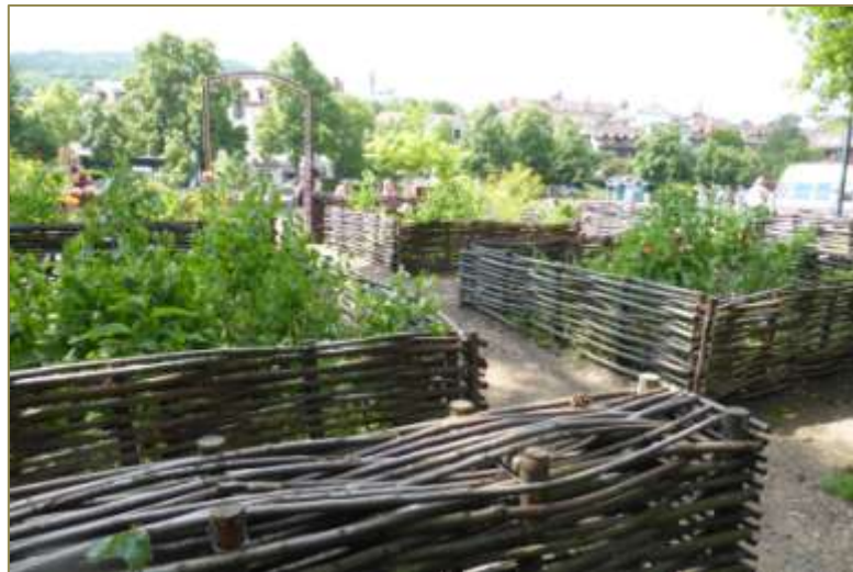
The Medieval Garden with its traditional willow walls

We walked through the Botanic Garden which consisted of various rooms – Japanese, Renaissance, and Jurassic Park etc. toward the boat "Dragon Fly" where lunch was served whilst cruising around the lake.