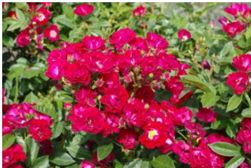
'Merveille des Rouges' (Dubreuil, 1911)

We decided to walk back to the Centre de Congrès through the lovely park. We used the opportunity to walk by the Rose Trial Garden to see some of the (perhaps) "roses of tomorrow". A lovely day, but with more to come: At 22.30 all hell broke loose – but in the good way. For more than 20 minutes the most fantastic fireworks, offered by the municipality of Caluire et Cuire, filled the sky over Lyon. From "our" side of the Rhône we had the best view of these spectacular fireworks which had brought lots of locals in the street. Fireworks cannot be described – they must be seen and experienced. I have never seen or experienced anything as exceptional as this.