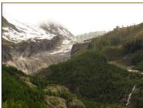
The Glacier d'Argentière photographed with a telephoto lens from Argentière. The bare rock shows the original thickness and extent of the glacier

The Glacier d'Argentière high above Argentière could be seen clearly as we left the restaurant. It still shows the spectacular crevassed ice front and the bare rock exposed in front of it as the glacier has retreated due to global warming.