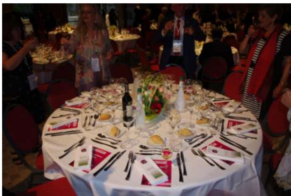
A table set for the Closing Dinner