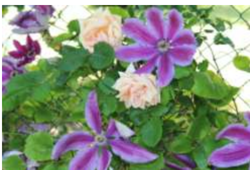
'Paul Lede' - 1913