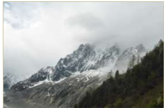
Beautiful views of The Alps

On to the Caveau Bugiste for wine-tasting with more food, and whilst the historic collection of stone tools, cork screws and liqueur glasses was riveting – and yes, there were some roses in bloom – the grandeur of those giant trees would have to be the ever-lasting memory of this Pre-Convention Tour.