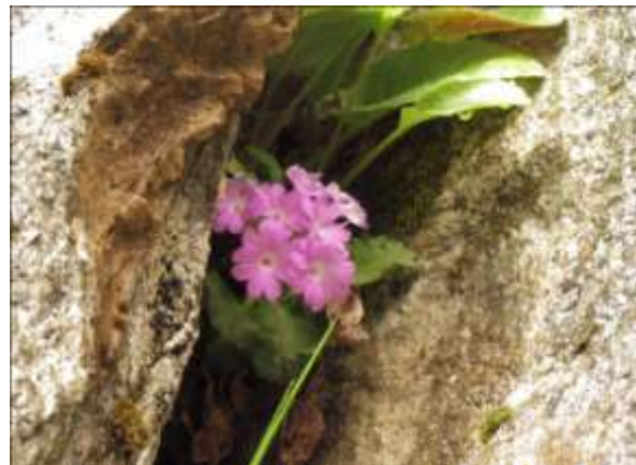
Primula sp. (possibly P. hirsuta ) flowering in a rock crevice at Montenvers

Only a few alpine flowers were in bloom near the station, including a small Primula species (possibly P. hirsuta ) with bright pink flowers but other plants such as Alchemilla alpina and various fern species were coming into active growth. No wild roses were evident in the vicinity but there were wide expanses of "Alpen Rose" ( Rhododendron ferrugineum ) that would flower about a month after our visit, in late June or early July.