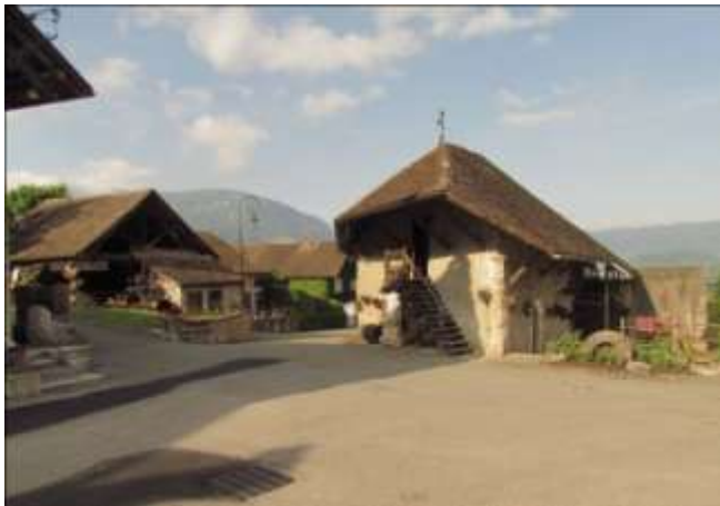
The museum and other buildings at Le Caveau Bugiste in Vongnes

We started our return to Lyon via Chamonix. On the way, we diverted to the village of Vongnes in the historic Bugey Region where we visited Le Caveau Bugiste , watched a film about wine production in the area and visited the museum of tools and equipment used in the vineyards and wine making. The museum included an attractive collection of walking sticks carved with grapevines. A wine tasting in the cellars followed, after which some members of the group purchased bottles or cases of wine!