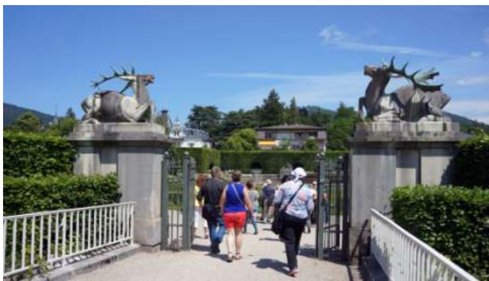
Gönneranlage Rose Garden - Baden Baden