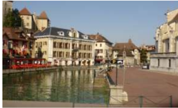
Walking around Annecy, nicknamed "Venice of the Alps"

We walked through the Botanic Garden which consisted of various rooms – Japanese, Renaissance, and Jurassic Park etc. toward the boat "Dragon Fly" where lunch was served whilst cruising around the lake.