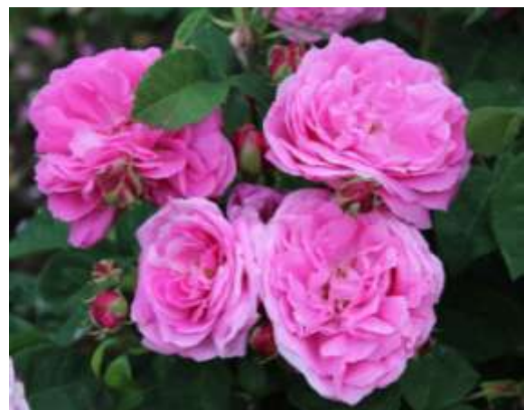
'Panachee d' Orléans'

Next stop - Château de Chambord is the largest of the Loire castles. In 1516, Francois I, King of France, came back from Italy with Leonardo da Vinci with a desire to create a large pleasure palace, symbolic of his power. Since Leonardo da Vinci died in 1519, mystery still swirls about the extent of his involvement in the castle design. But some of the unique architecture, such as the positions of the double helix staircase, openings are included to provide a flow through the building and the presence of vaulted ceilings on the second story are many touches that appear to be da Vinci's.