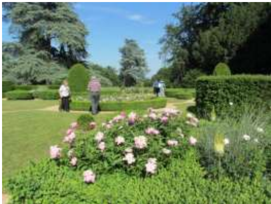
Old established trees form a backdrop to this section of the garden