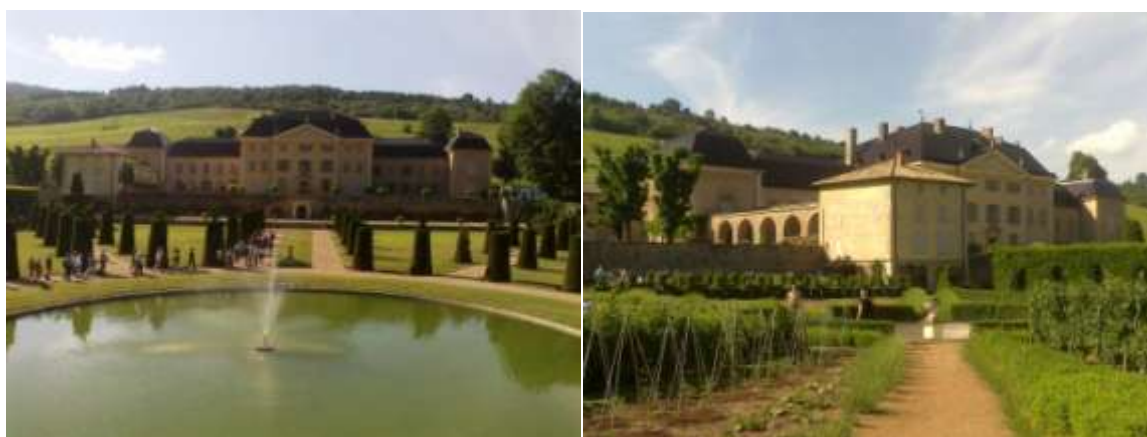
Château De La Chaize