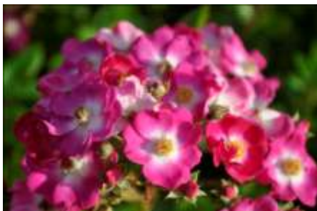
No. 523 "La Palme du Rosier Paysager" – for the best shrub or grandcover rose Y 1247 Breeder: Lens, Belgium

Some other outstanding rose novelties were awarded a medal by the members of the permanent jury and have to be mentioned: