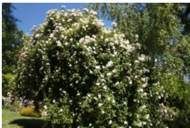
'Venusta Pendula' reintroduced in 1928 by Kordes