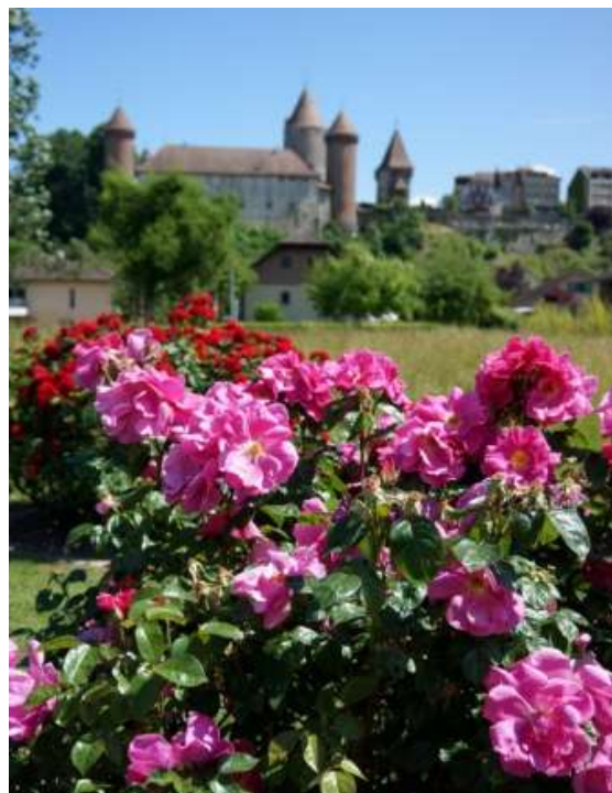
Château de Chenaux à Estafvayer from Roseraie d'Estafvayer