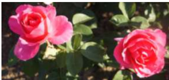
'Monique Laperrière' seen in La Clé de la Rose

Cluny is the centre for Romanesque Architecture in France and is approximately 90 km north of Lyon. The garden was opened in June 2010 and has more than 300 roses and 54 varieties and also contains many perennials and irises. In bloom at Cluny and with several plaques about its significance, was 'Resurrection', a deep pink HT rose, bred in 1976 by Michel Kriloff (France) in memory of 22 women from Cluny who were deported to Ravensbrück concentration camp in 1944.