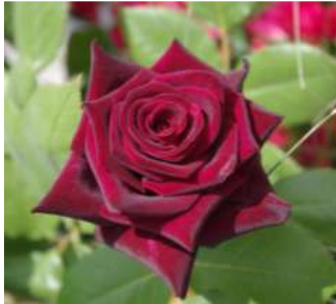
'Black Baccara' (Meilland, 2000)

Sunday, 31 st May - After lectures and presentations of future conventions the afternoon was free to enjoy the Rose Festival in Parc de la Tête d'Or. Lots of people and lots of activities were in the rose garden. Local rose breeders, different rose societies, cities, rose parks and gardens and private people had stands exhibiting their roses, organizations, parks, products and other excellences. The city of Orleans' stand was outstandingly tasteful and from the city of Nantes there was quite an exhibition of pots in all shapes and sizes. A walk along the breeders' stands was a show window for new varieties. Eye catchers for me were, among others 'Black Baccara', 'Chateau de Pupetières' and 'Souvenir de Josephine'.