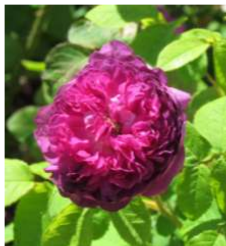
'Fleurs de Pelletier'

After three days of reveling in the beauty of the roses and admiration for the dedication and efforts of the people who made these wonderful gardens possible, our trip to Versailles was the low point of the post tour for me. Although it is one of the "must-see" venues for any visit to Paris and an architectural marvel, it struck me as a monument to royal privilege and excess, a culture which led inevitably to the French Revolution. Elbowing our way through the Hall of Mirrors with thousands of other tourists was a far cry from wandering through the rose gardens of previous days.