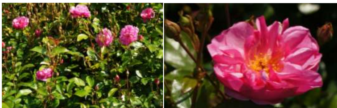
'Louis Blériot' AEN 'Lavender Meidiland' (2009)