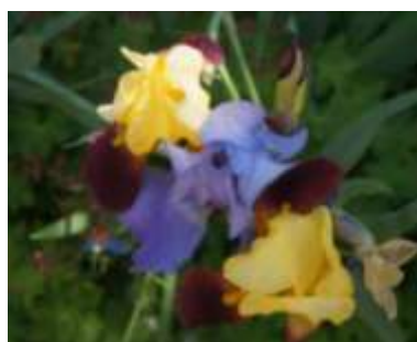
Colourful Irises among the roses