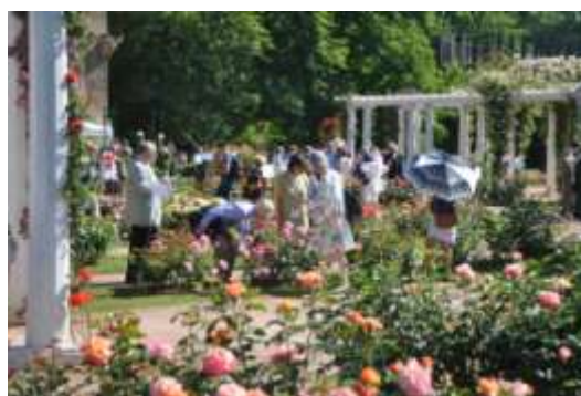
International Jury at Parc de la Tête d'Or