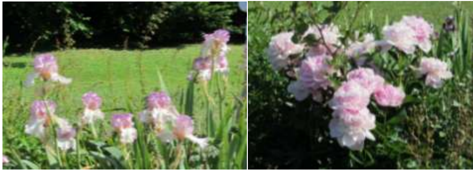
Delicate shades of irises and peonies adorn this tranquil garden

The Bionnay Gardens and Château are situated within the Beaujolais region and date back to the early 1900's. In 2011 the garden was listed as 'Jardin Remarquable' by the French Ministry of Culture. This 5 hectare garden comprises a number of smaller gardens of different themes.