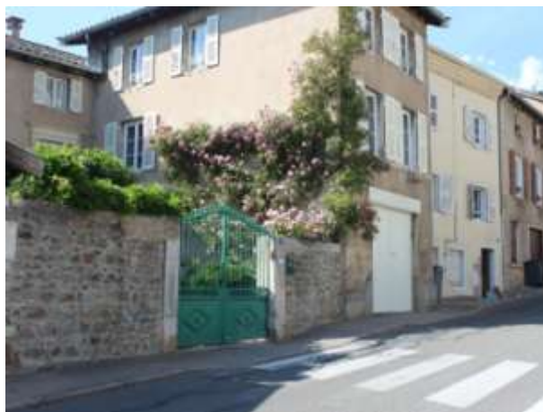
Local golden stone buildings