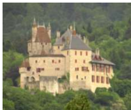
The 'fairy-tale' castle, Château de Menthon-Saint-Bernard