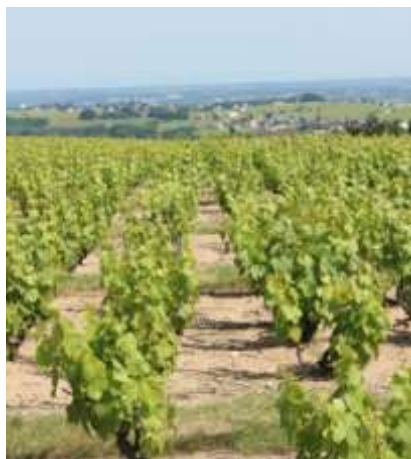
Acres of vineyards

We departed early Tuesday morning and headed northwest toward Orléans, travelling through the Beaujolais (wine) country. The region is filled with vineyards and buildings of local golden stones that are distinctive of the area.