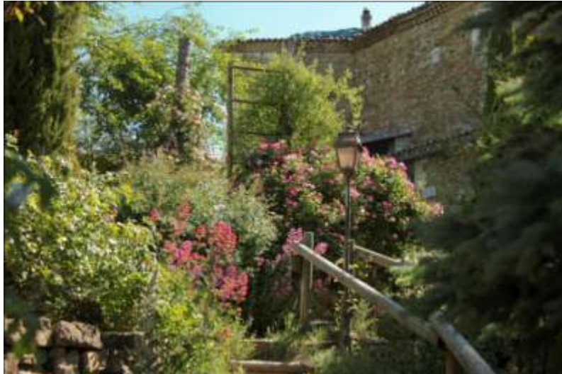
Abbey of Valsaintes garden

The last stop was the garden of Dominique Croix at Bourg Argental in the heart of Pays du Pilat regional park which lies in a mountain range between 1400 and 1432 meters altitude. Here the Mediterranean, continental and oceanic climates alternate and compete and give an incredible diversity of natural resources.