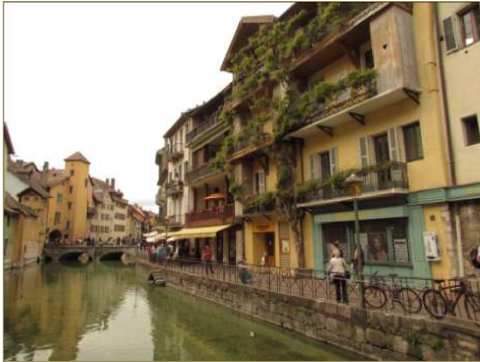
A venerable Wisteria in Annecy le Vieux

We left Annecy at about 15.30 and took the road to Chamonix. As we approached Chamonix, we passed the spectacular Glacier des Bossons , arriving in the town just after 17.00, in light rain. Chamonix is about 224km from Lyon.