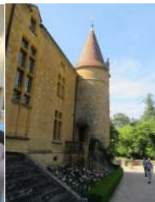
The yellow stone mansion surrounded by beautiful gardens